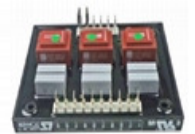
R731 Type Leroy Somer