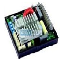
SR7 Type Mecc-alte