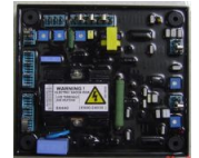
MX341 Type Newage Stamford